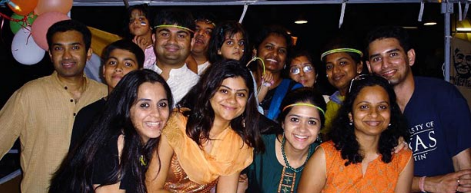
Asha Dallas Chapter - Anand Bazaar