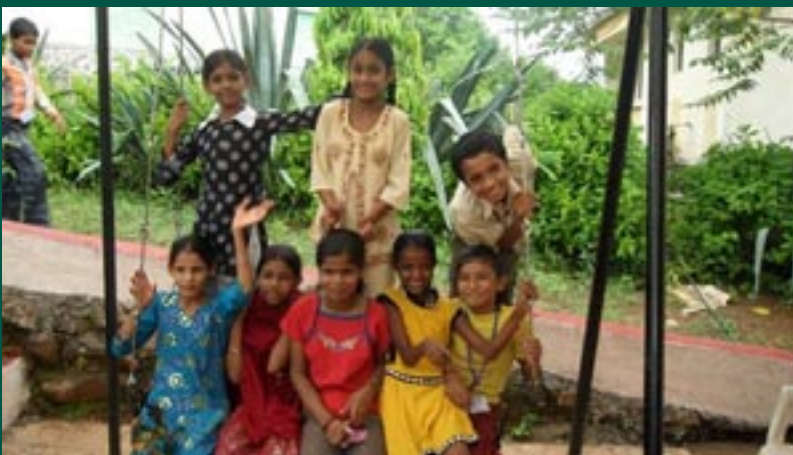
Asha Mumbai Chapter - children from the slums of Powai.

We received donations of around Rs.1.50 lacs and some donations in kind, and some activities were sponsored.