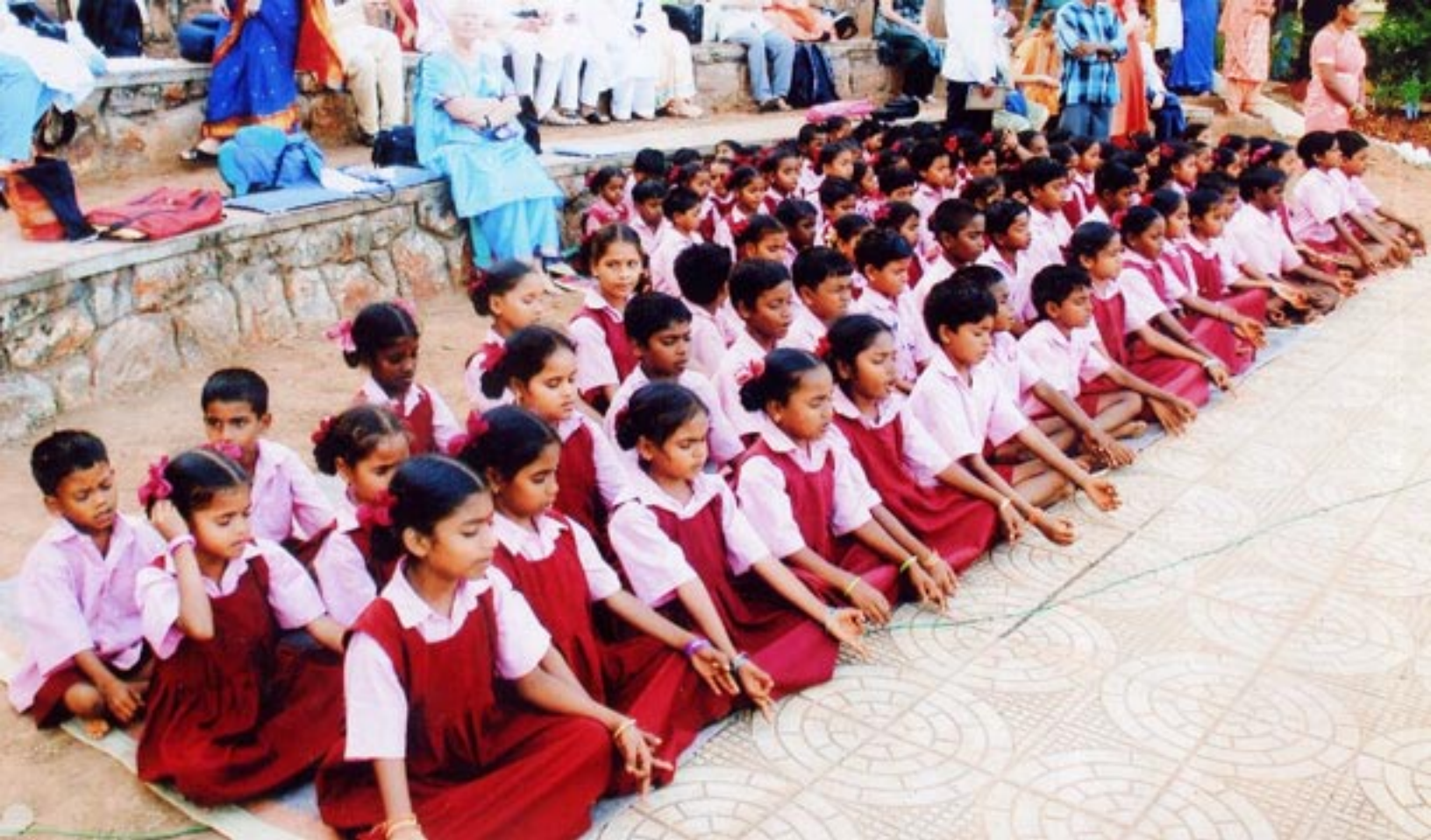
Asha Cincinnati Chapter - Vasista Mithila Vidyalayam, Andhra Pradesh.