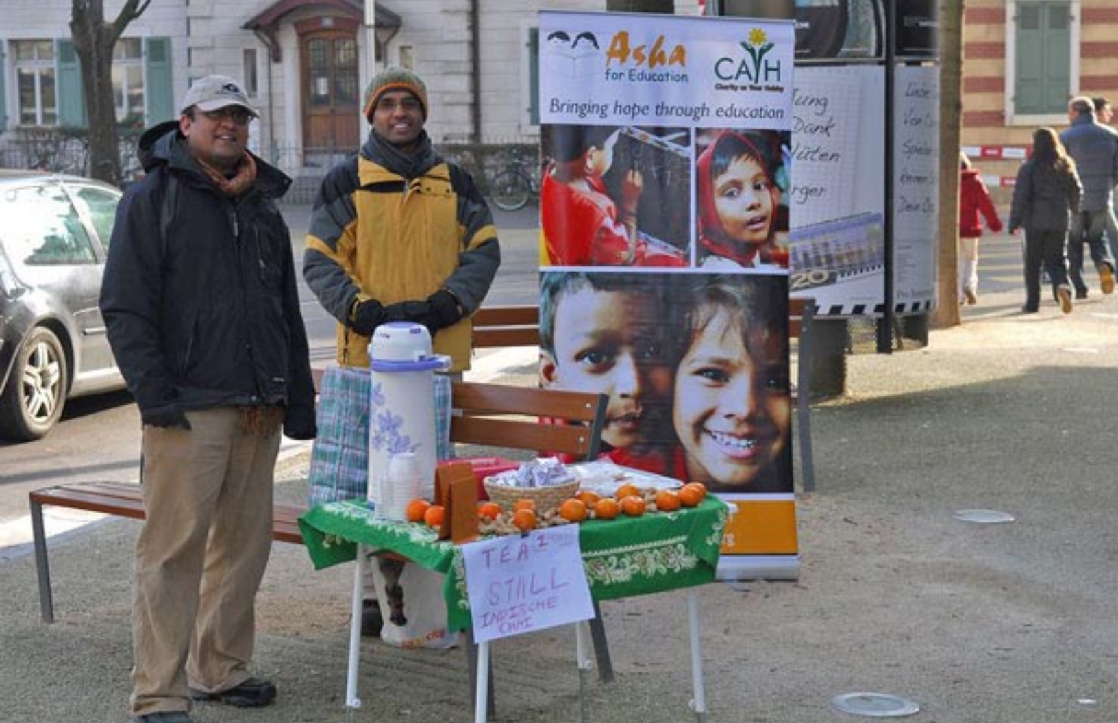
Asha Zurich Chapter - Volunteers braving the cold at the Basel Tea stall